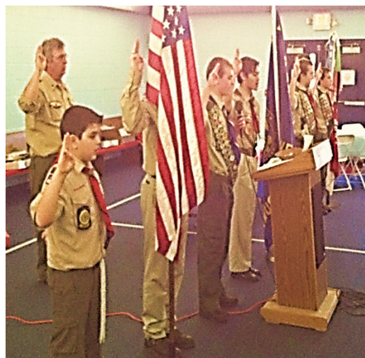
Awards banquet opening