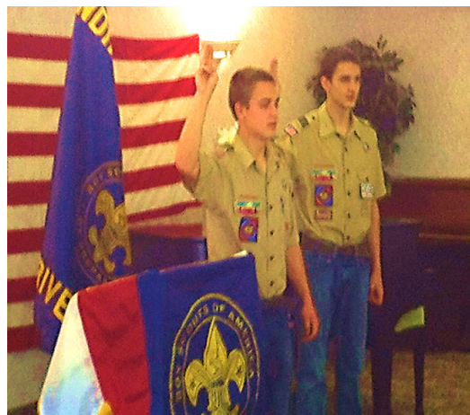
Friends of Scouting luncheon in Horseheads